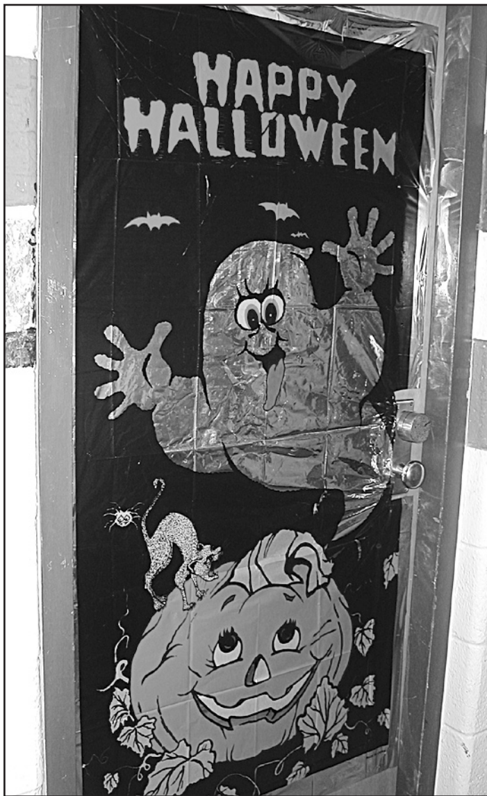
Decorated doors, like this one in Wright Residence Hall, are a common sight before holidays, especially Halloween.